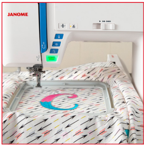
250 Built-in Embroidery Designs