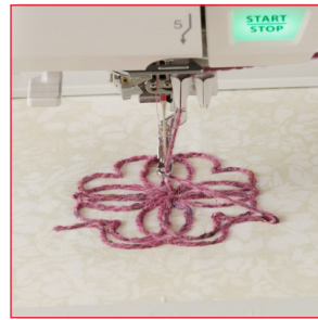
Embroidery Couching Function